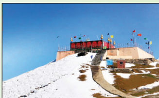
SHIKARI MATA TEMPLE