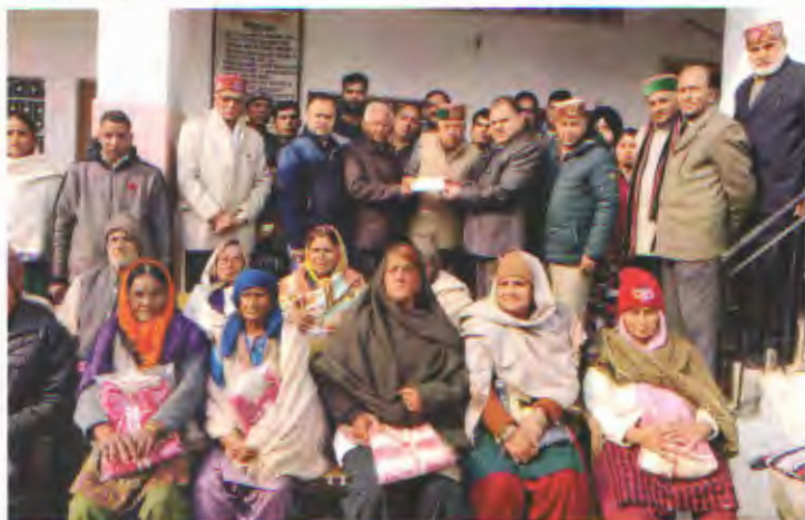
Medical Health Camps Organized and Health Check-Up in Selected Villages by the Team of Doctors of Abhilashi Ayurveda College and Research Institute of Abhilashi University: