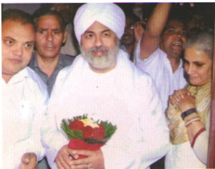
DHAN NIRANKAR JI