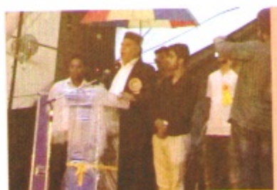
Shri G.S. Bali Hon'ble Minister of Food & Civil Supplies and Technical Education, Government of Himachal Pradesh visited Abhilashi Group of Institutions