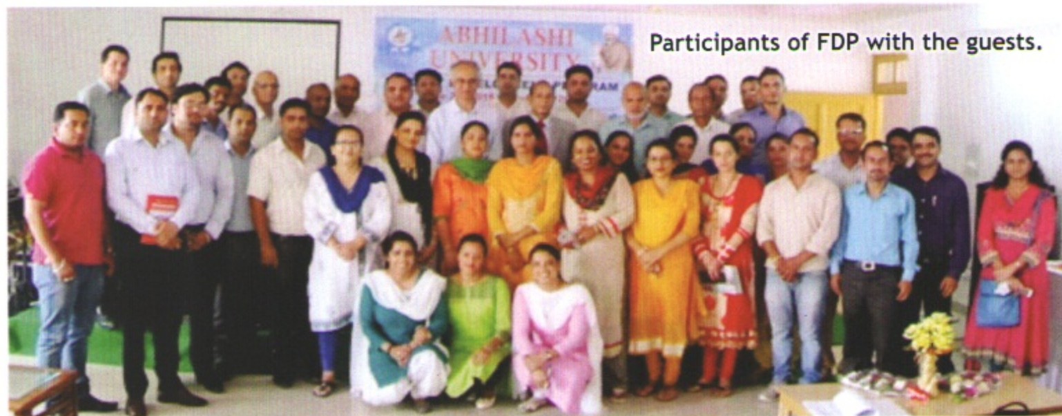
Participants of FDP with the guests.