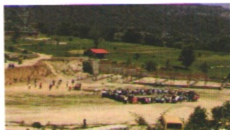
Students Playing different games in Abhilashi University Campus