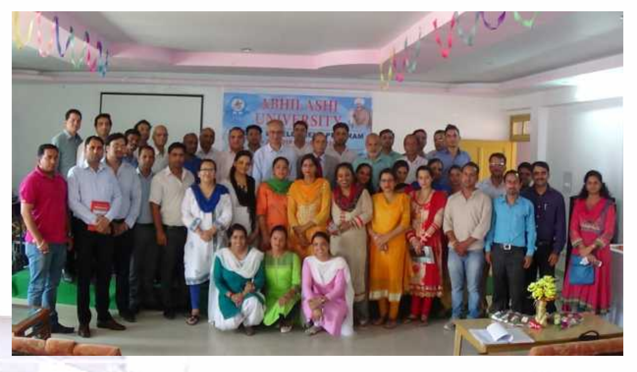
Participants of FDP with the guests.